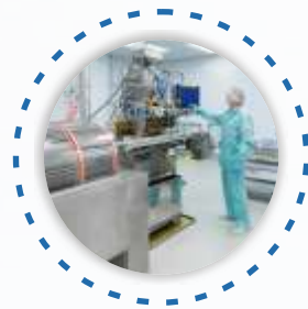
MANUFACTURING LINE IDENTIFICATION