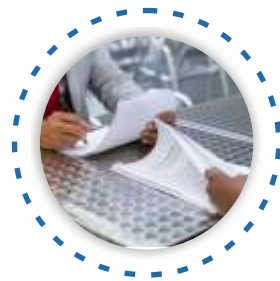
MACHINERY & UTILITY DOCUMENTS