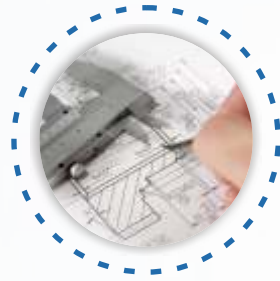
DRAWING & LAYOUT