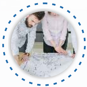
UTILITY DESIGN MEETING PROCESS REQUIREMENTS