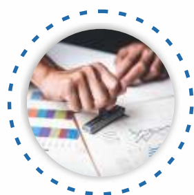
PLANT VALIDATION DOCUMENTS